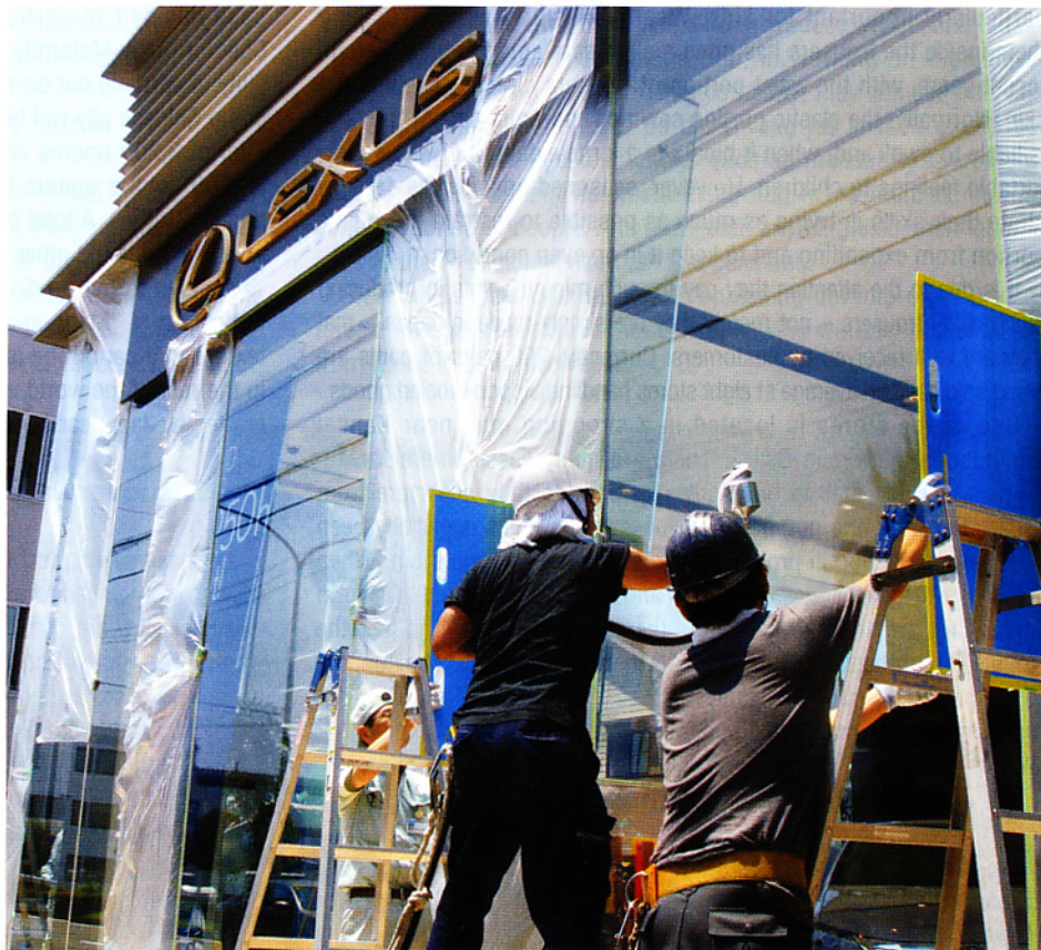
Glass coating under way